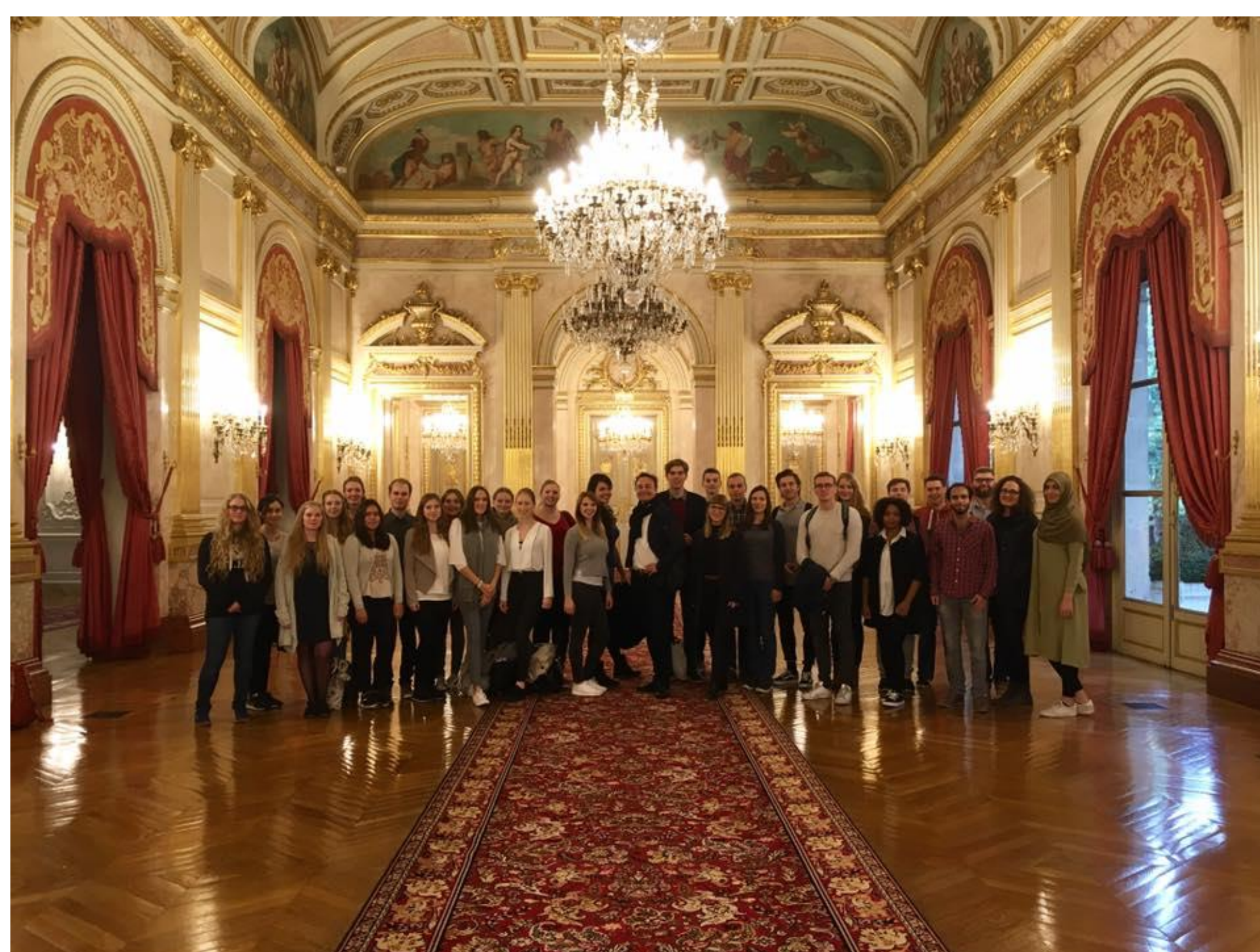
Excursion Group in the French National Assembly