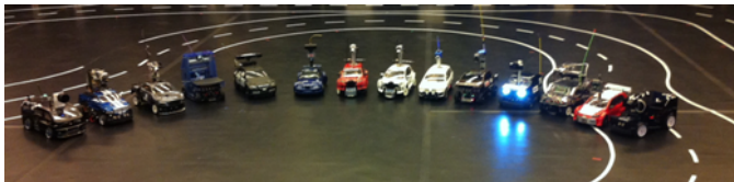
Figure 1. Contestants in the Carolo-Cup 2014 competition.

In the following, we describe the annual student competition Carolo-Cup. This competition for self-driving miniature vehicles in 1:10 scale, as shown in Fig. 1, was introduced at Technische Universität Braunschweig in 2008. One of the motivational drivers was the successful participation in the 2007 DARPA Urban Challenge [8] for real-scale self-driving cars on the one hand, and the need to involve students from engineering disciplines already in their education with the challenges of this technology on the other hand.