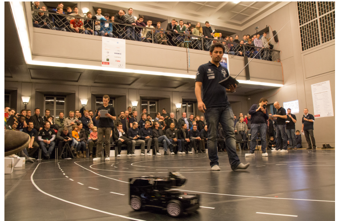
Figure 2. Driving in the discipline lane following.

c) Lane Following: The first dynamic discipline is to follow white lane markings on a black carpet as shown in Fig. 2. The track comprises of straight roads, arc-based curves, S-shaped curves, clothoid-based curves, intersections, and a parking strip.