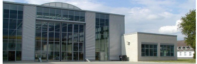
Figure 2: The IFL test facility.