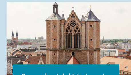
Braunschweig's historic centre