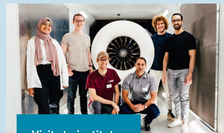
Visits to institutes