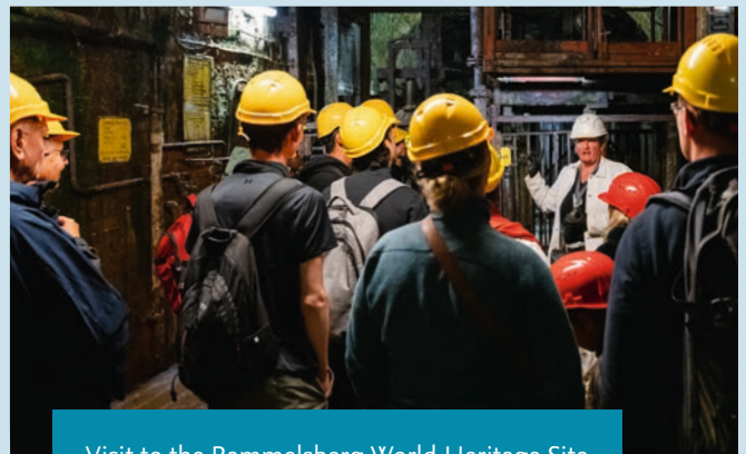
Visit to the Rammelsberg World Heritage Site