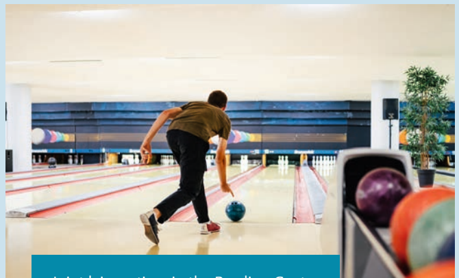
Joint leisure time in the Bowling Center