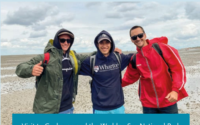
Visit to Cuxhaven and the Wadden Sea National Park