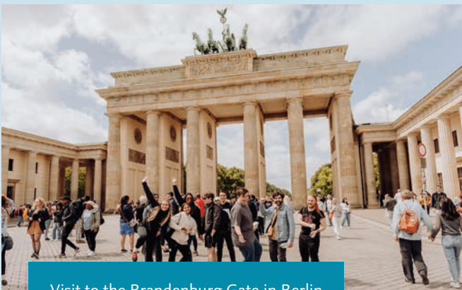
Visit to the Brandenburg Gate in Berlin