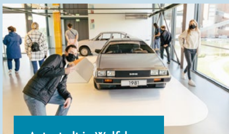
Autostadt in Wolfsburg