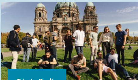
Trip to Berlin