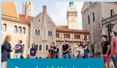
Braunschweig's historic centre